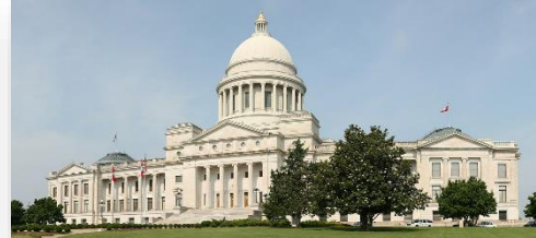
State Capitol 1996

The new Capitol would be built on 40 acres on what was then the very western edge of Little Rock on a site that housed the state penitentiary. It took 16 years, from 1899 to 1915 before the Capitol was completed.